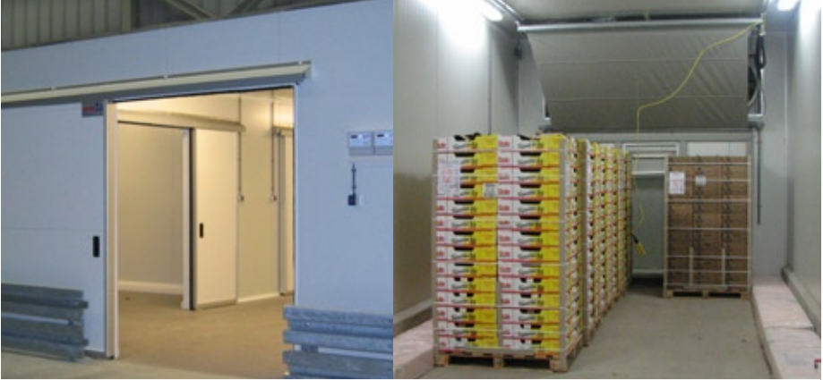
Two views of cooling facilities operated by Celtic Cooling.

The projected facility encompasses a warehouse of 200 m 2 capacity, and a prefabricated cold room of 100m 2 . The cold room will have a maximum physical storage capacity of 200 tonnes. With average storage duration of 2 weeks, the maximum annual storage capacity is 5,200 tonnes. See the pictures above for some examples.